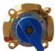
3-Port Mixing Valve