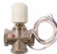
MR03 Mixing Valve