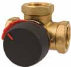
3-Port Mixing Valve