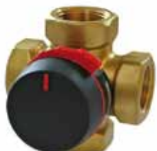
4-Port Mixing Valve