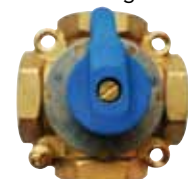
4-Port Mixing Valve